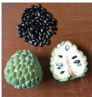
Figure 1. General appearance and cross section of custard apple ( Annona squamosa L.) fruit and the seeds.

Physical properties including seed index, bulk density, hull and kernel percentages and seed dimensions including length, width and thickness were determined [12]. Proximate analysis of CASKF including moisture, crude protein (N x 6.25), crude ether extract, total ash and crude fiber were carried out according to AOAC [13]. procedures unless otherwise stated. Nitrogen free extract (NFE) was calculated by difference. Total phenolic compounds were determined by Folin- Ciocaltu reagent [14] after extraction with 70% ethanol [15].